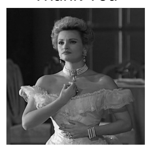
And Good Night!